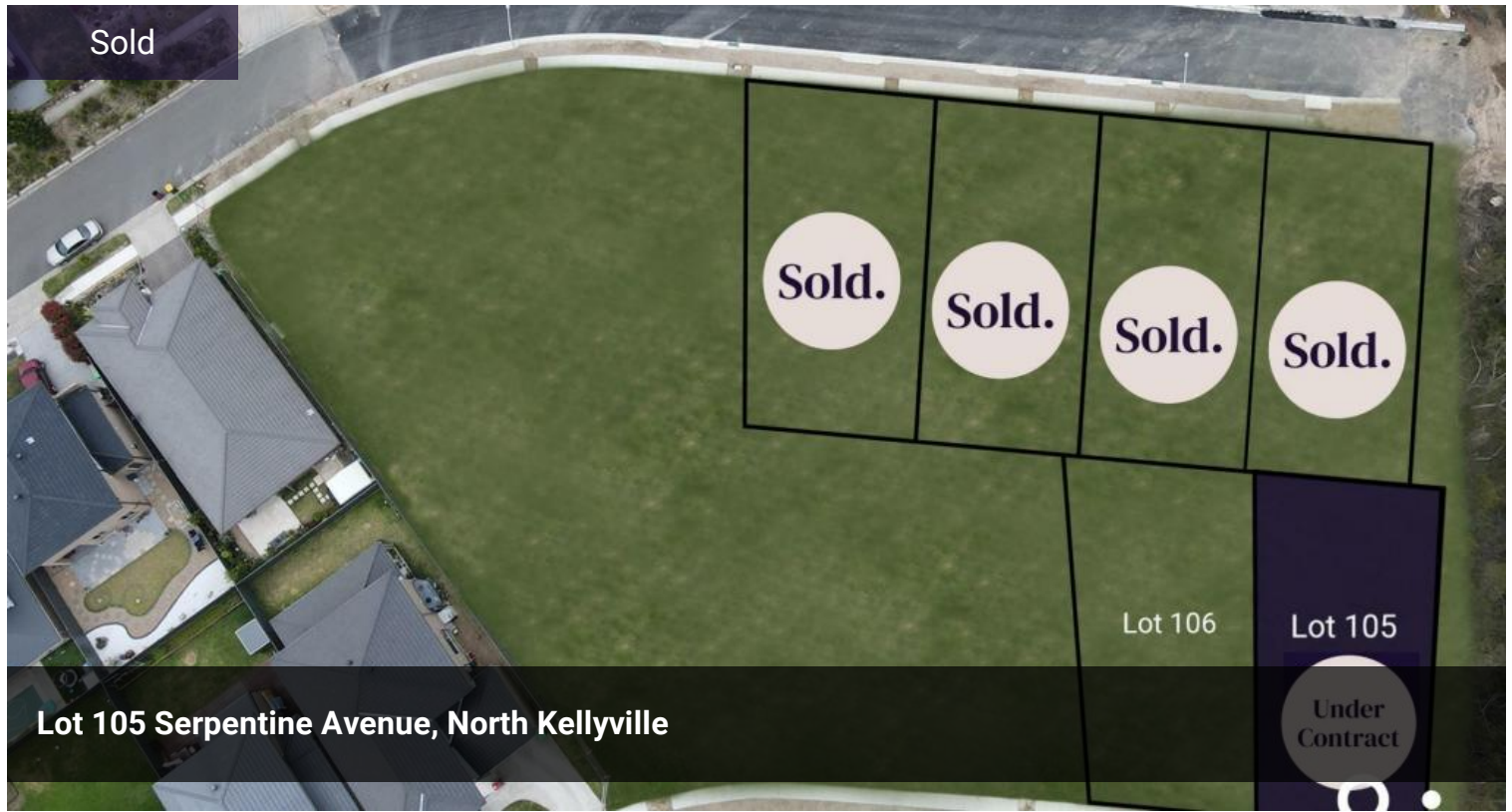
Lot 105 Serpentine Avenue, North Kellyville