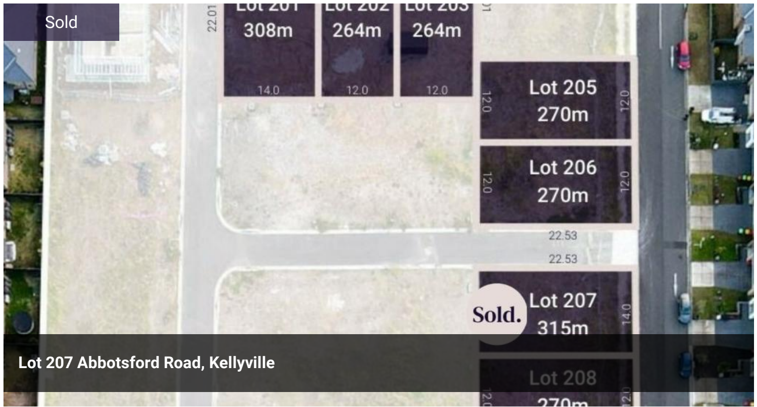
Lot 207 Abbotsford Road, Kellyville